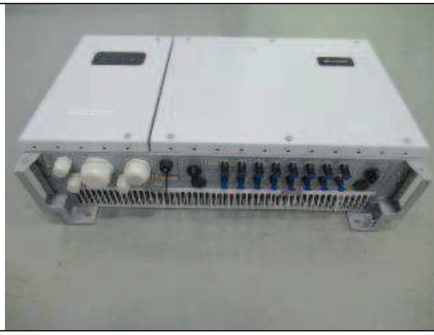
Testing for IP6X