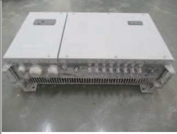
Testing for IPX5